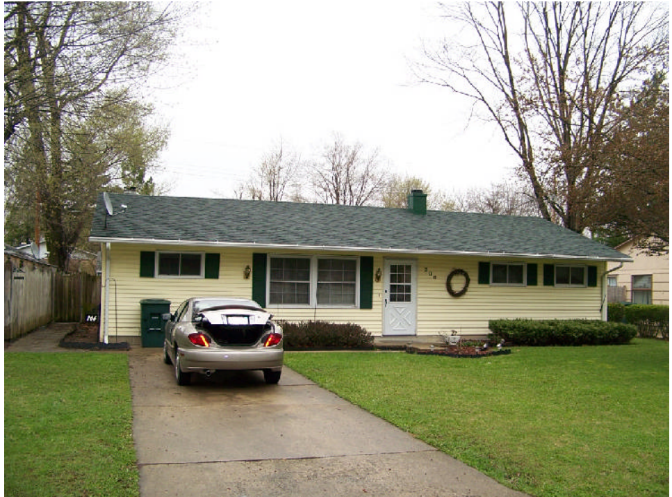
206 North Shellbark.